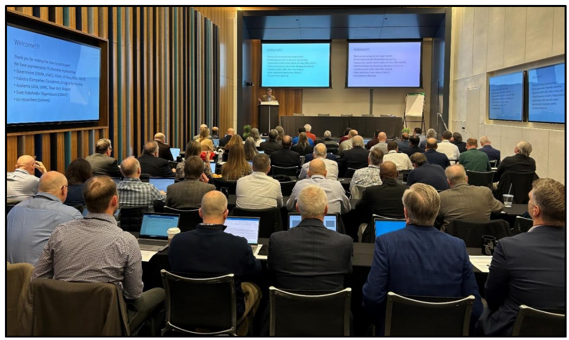
Figure 2: The Workshop included some 70 participants representing government, industry, and academia.