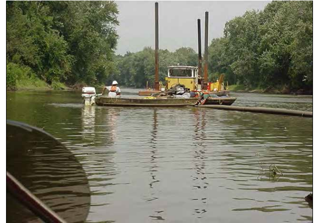
Small hydraulic dredge operating in Rock Island District

Many rivers with navigation channels experience degraded habitat due to vessel wake and other anthropogenic influence in shallow water. Near-bank wetland and shallow water habitat have been reduced because of erosion caused by channel realignment, vessel wake, or near-bank construction. Nearshore habitat supports ecosystem diversity and bank stability. Many USACE districts have developed structures which support habitat diversity by creating secondary channels and quiescent backwaters. An alternative to hard structures is sustainable use of dredged sediment to create dynamic nearshore features which reduce vessel wake energy near banks. These features are degraded by ongoing vessel wake, but are renourished during subsequent dredging cycles. This beneficial use strategy is consistent with the USACE Engineering with Nature initiative and provides solutions which support navigation, flood risk management, and ecosystem restoration business lines.